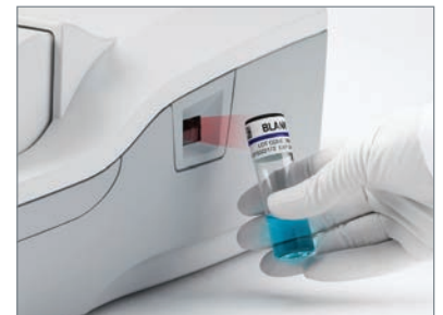
3. Scan calibration solutions.