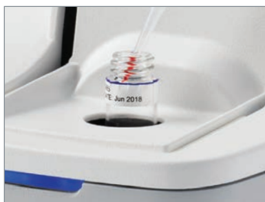
4. Dispense samples.