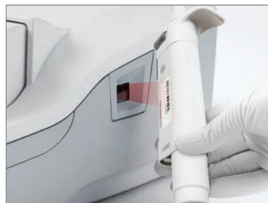
2. Scan pipette